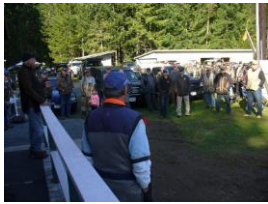
An introductory and safety talk starts the shooting day.