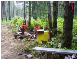
Some of the portable machines set up at one station.