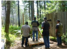
Two of the stations in the woods.